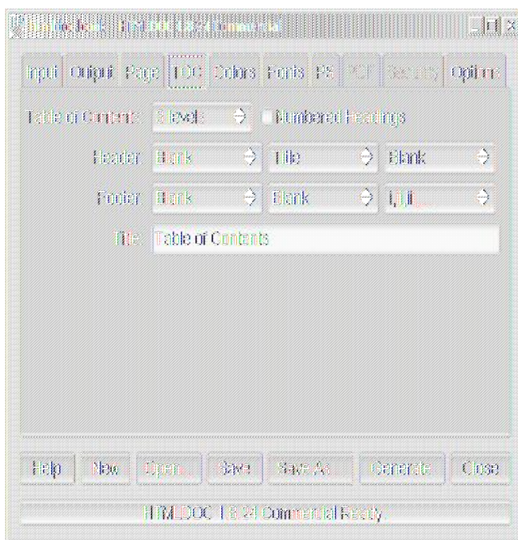
Figure 7-4 - The TOC Tab